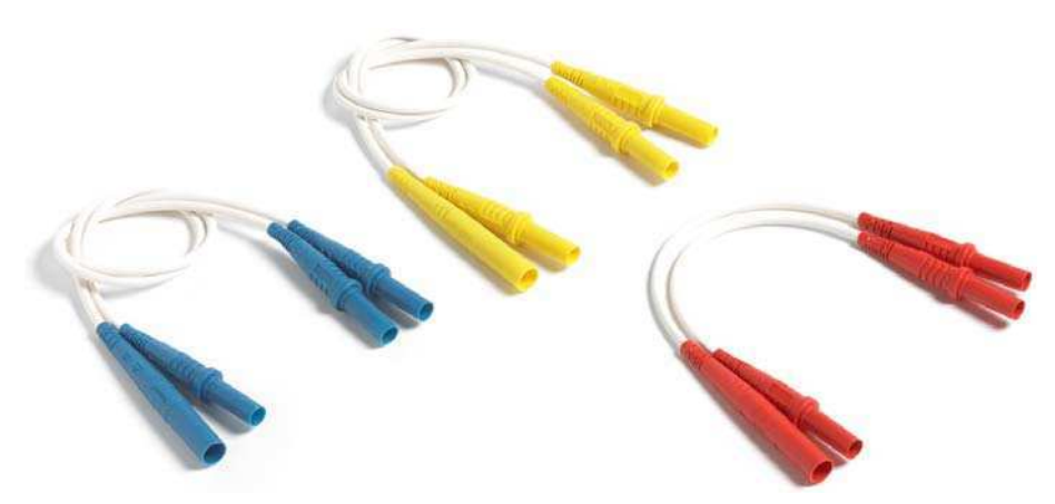
Model 73087, Jumper Test Lead Set